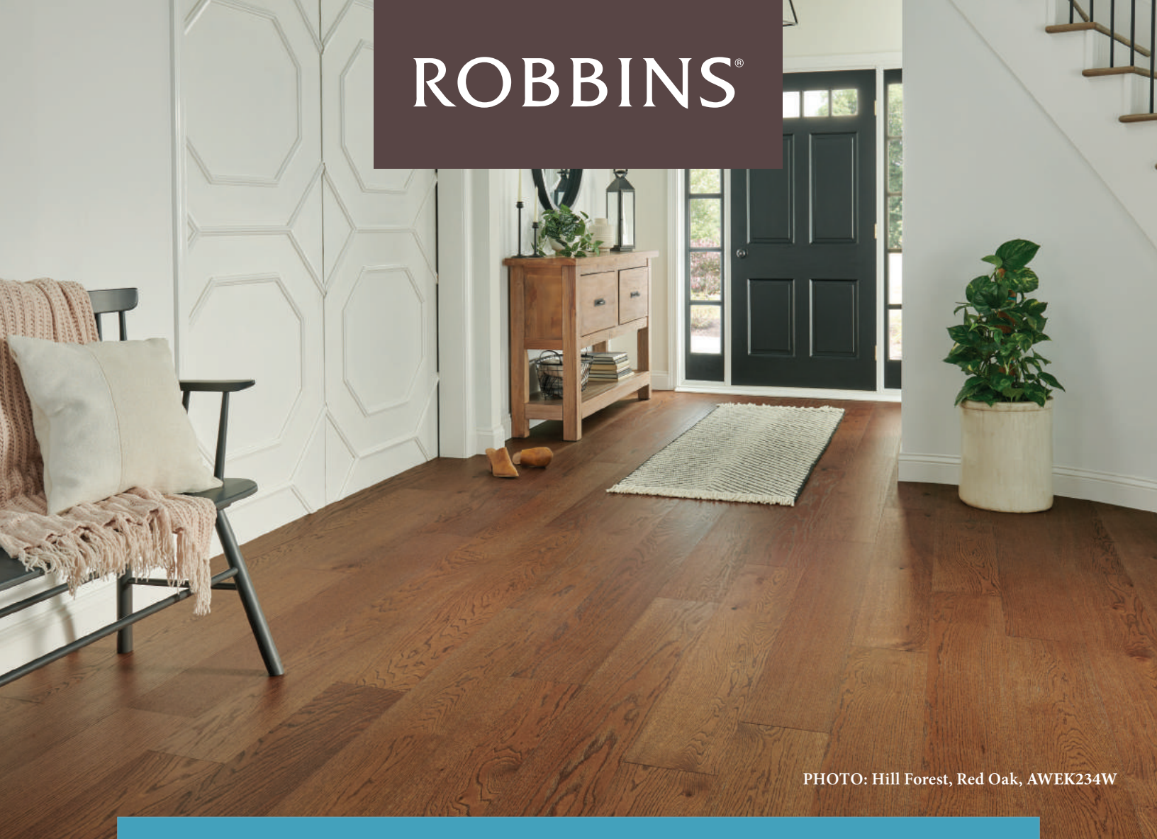
PHOTO: Hill Forest, Red Oak, AWEK234W