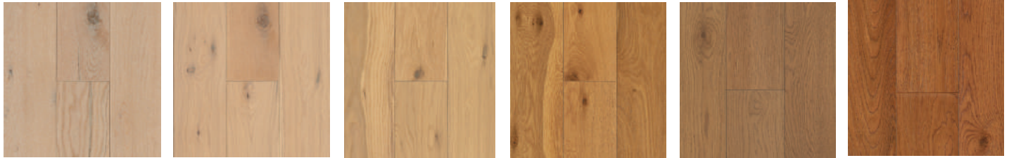
Serene Moment 7-1/2" AWEK254W Dune Landscape 7-1/2" AWEK264W Spring Shade 7-1/2" AWEK274W Natural 7-1/2" AWEK204W Field And Forest 7-1/2" AWEK284W Gunstock 7-1/2" AWEK214W