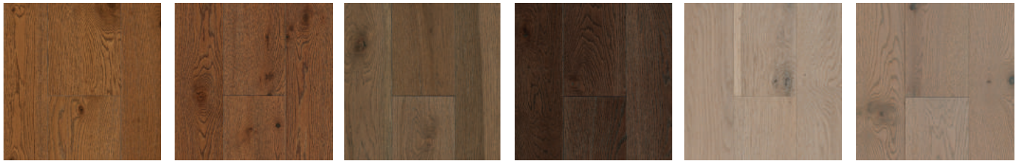
Saddle 7-1/2" AWEK224W Hill Forest 7-1/2" AWEK234W After Dusk 7-1/2" AWEK244W Woodsy Character 7-1/2" AWEK289W Maritime Charm 7-1/2" AWEK294W Cool Hue 7-1/2" AWEK299W